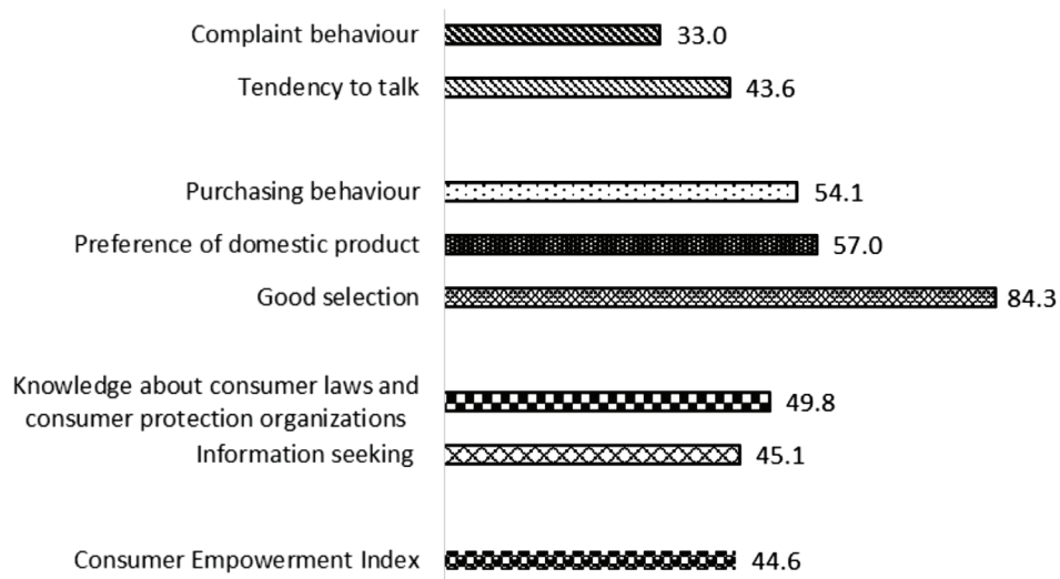
Figure 1. Average index of consumer empowerment in public transportation

service selection behaviour has the highest index compared to other dimensions. Thus, respondents in the field of public transportation have a way to choose good public transportation services. Meanwhile, the dimension with the lowest index is the complaint behavioral dimension. This is because the respondents still lack the awareness to complain when they are unsatisfied or disappointed with the services in transportation. Otherwise, Simanjuntak and Yuliati (2015) research showed that the lowest index of consumer empowerment is in the dimension of knowledge about the Act and the Institute of Consumer Protection. Other researches also showed that the lowest dimension was complaints behavior (Simanjuntak, 2019; Wandani & Simanjuntak, 2019). In comparison, complaints about business actors are very useful for the sustainability of selling activities (Simanjuntak & Hamimi, 2019).