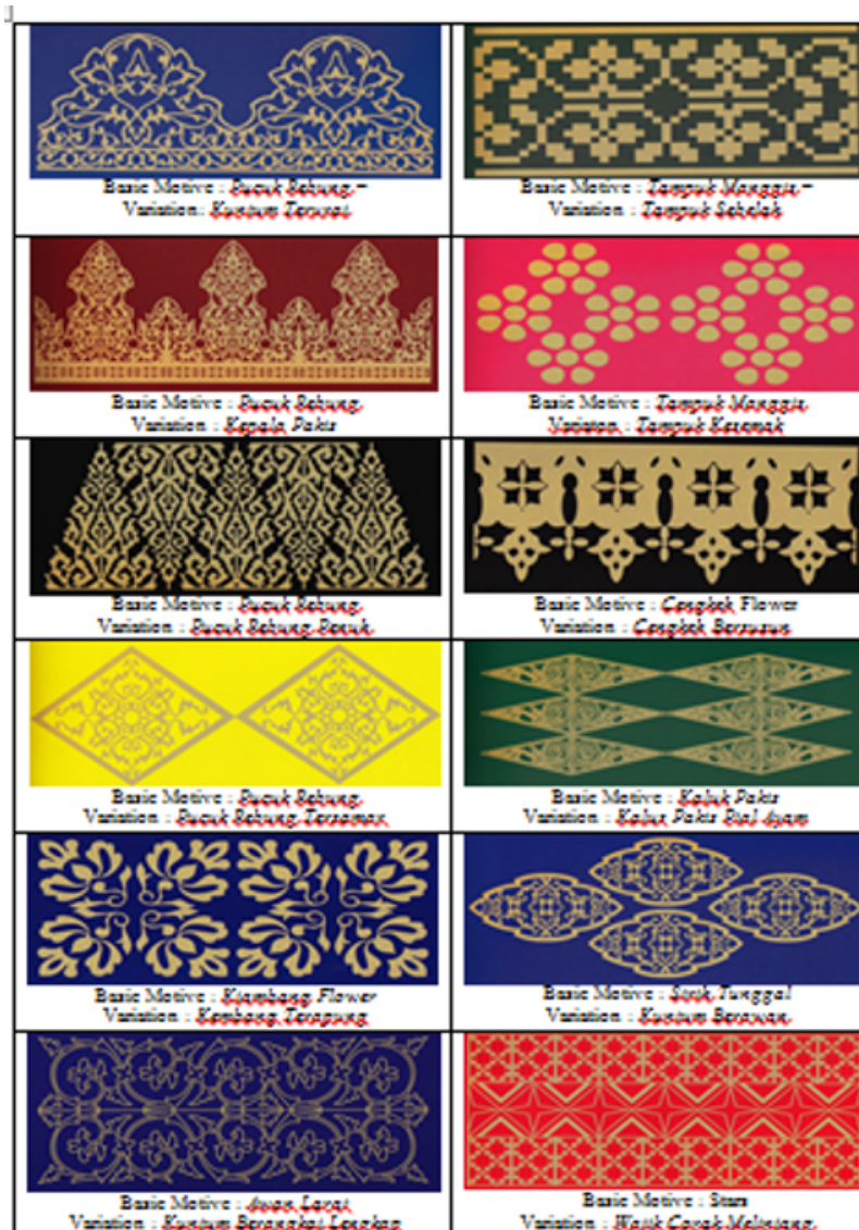
Figure 1. Basic Motives and Variation of Riau Malay Woven

a sustainable superiority in this business so that it appears different from competitors.