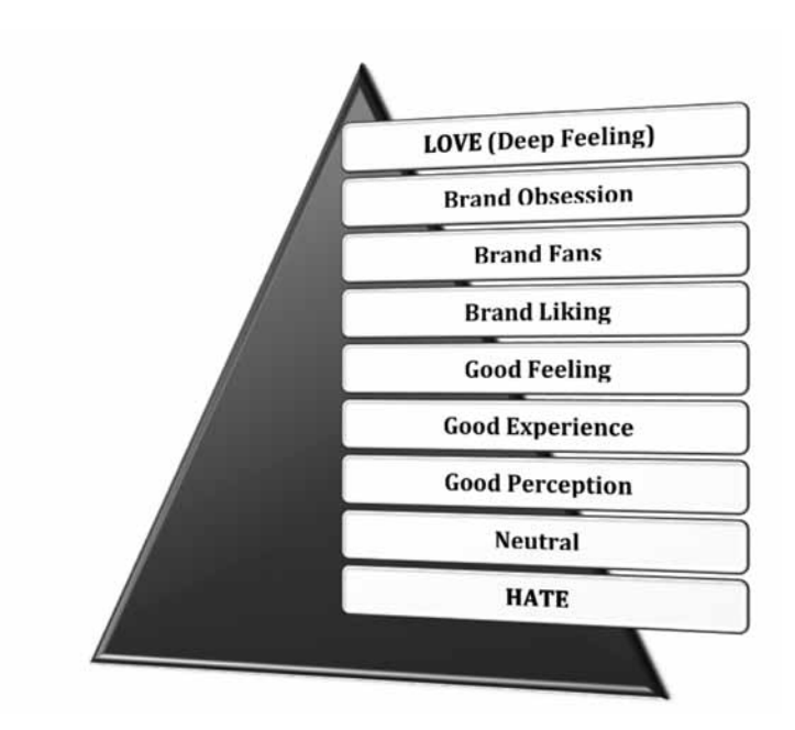
Figure 6. The Pyramid of Love towards Brand

Long-term effect of an ad is love or hatred of consumers to the advertised brand or product. A consumer, who has already interested to purchase a product after being influenced by the ad's message (visual or verbal), and feel satisfied after a 'simple confirmation' or even 'positive disconfirmation',