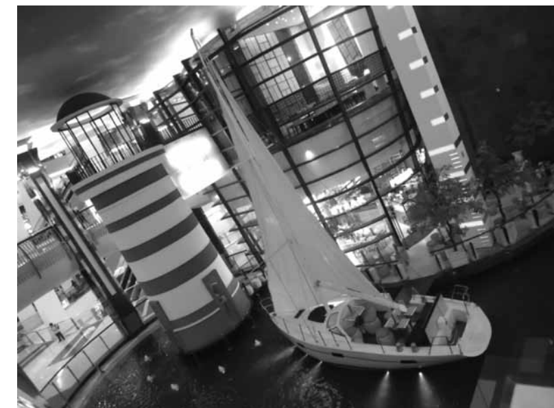
Image 1. Atmosphere that Provides Experience in a Jakarta Shopping Center

Shopping center design creates new experience through the atmosphere that is perceptually felt by the human senses. New forms and concepts as well as creative ideas regarding the creation of experience and how to have a shopping center with a point of interest for consumers should be considered. Similar to a recreational center, a unique design will help tenants creatively create a theatrical store ambience for visitors. This way, visitors can feel the comfort of shopping with more introductions of new experience created by retailers. This experience involves various sensory reactions (for instance visual appearance, sound, smell, and texture).